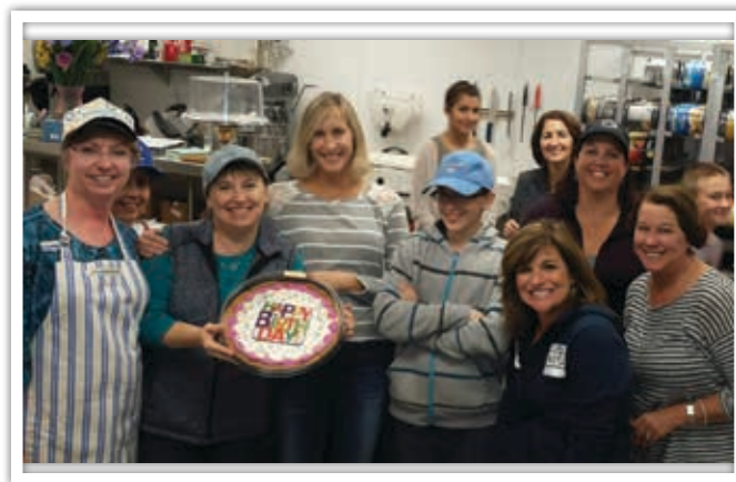
Stephen Center Guild Dinner

This year the guild partnered with vinNEBRASKA Foundation to host the 32nd annual Grand Wine Tasting event held on April 8-9, 2022 putting Cruise Away on hold