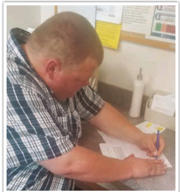
Travis Signing Group Home Lease